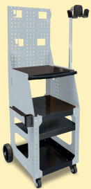
Spot 1600 trolley ref. 051348