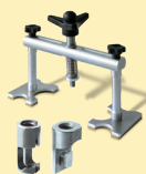
Alu Puller ref. 051003