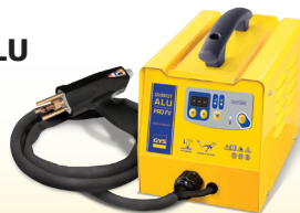
GYS SPOT ALU PRO FV ref. 021990